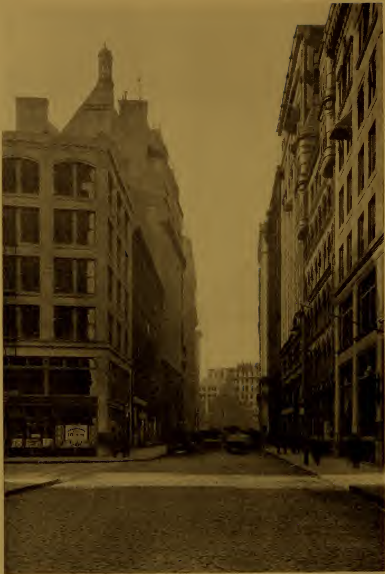
View from Fidelity Trust Co. Site in 1916 looking west towards the Old State House